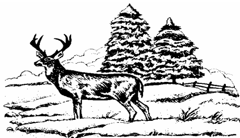
As the deer, panteth for the water, my soul long for Thee.

Well, Ladies, did you make New Year's resolutions? Are you keeping them?